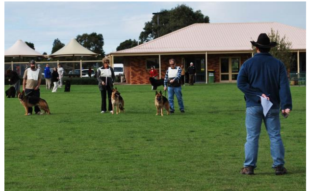
The Guntest BANG The dog should stand firmly showing no concern or agitation