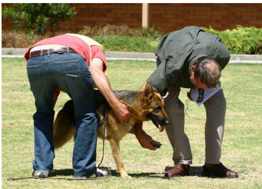
Are the nails dark?