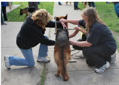
Measuring the height, depth of chest and chest circumference. Has he got 2 normal descended testicles?