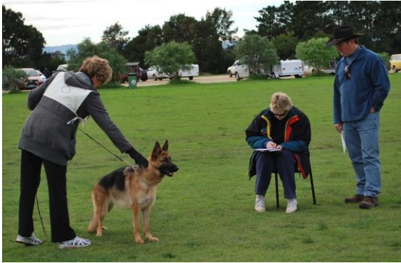
The general description is recorded

Now down to the details. All aspects of the dog are critiqued from his head right down to the colour of his toe nails, his temperament and movement