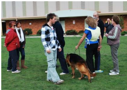
The Crowd Test - The dog is walked into the crowd on a loose lead. The surveyors observe the behaviour. He should be calm, confident and relaxed