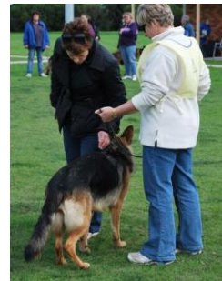
The Individual Approach Again the dog should be calm, confident and relaxed