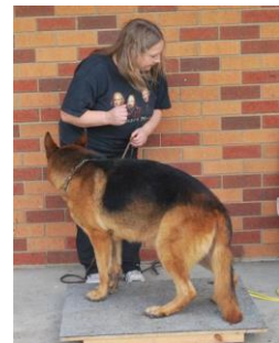
Now on to the scales