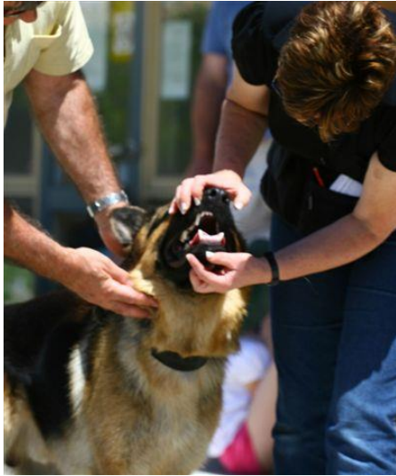
Checking the bite. It should be a scissor bite neither over or undershot

Positive identification- Scanning the microchip number.