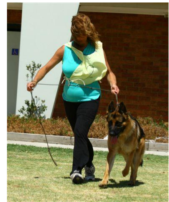
Hocks and elbows. Are they firm? Is he stepping correctly?

The very detailed Survey form is completed with the dog's Particular Virtues and Faults noted. The classification is announced and finally the Breeding advice is given