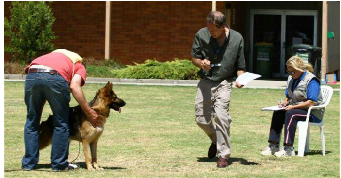
Does she stand correctly?