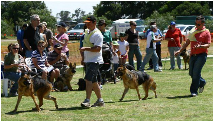
On the move

You need to report to the Registrar. You will be given a numbered vest. The microchip will be verified. The attending dogs will be lined up, first the dogs then the bitches. All the animals in the survey will then undertake some warm-up laps. The Surveyors will discuss the animals and their potential classifications.