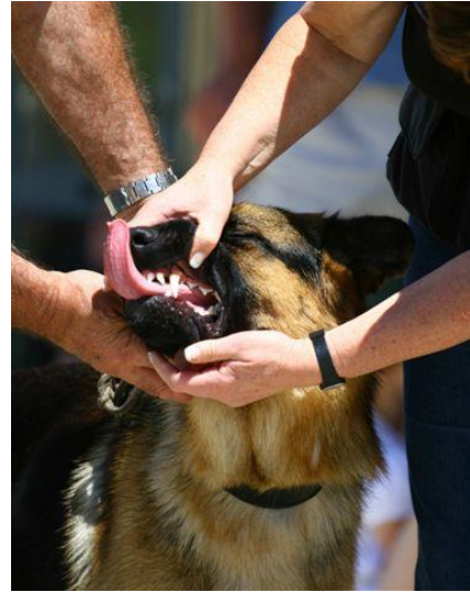
Checking the teeth. Any variations/abnormalities are noted